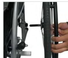
Rear wheels Quick release