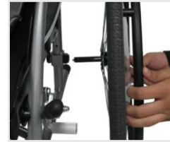
Rear wheels Quick release